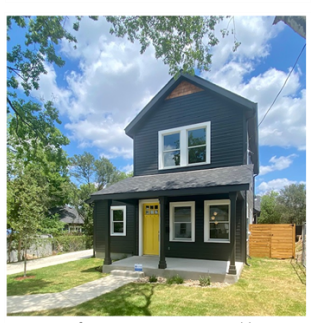
Inspiration for project – Past New Build Project Modern Farmhouse / Urban Infill